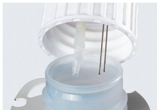
Sensitive level sensor to prevent liquid overflow