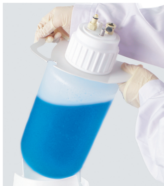
Stand for transferring the bottle securely and holding the hand operator